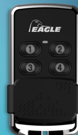
EG646 4 button visor transmitter