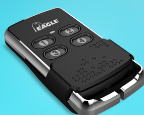
EG644 4 button keychain transmitter