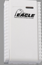
EG650 & EG652