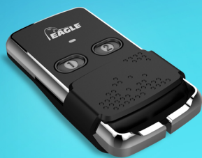
EG643 2 button keychain transmitter