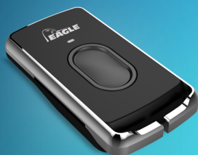
EG640 1 button keychain transmitter