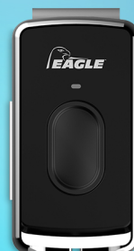
EG642 1 button visor transmitter